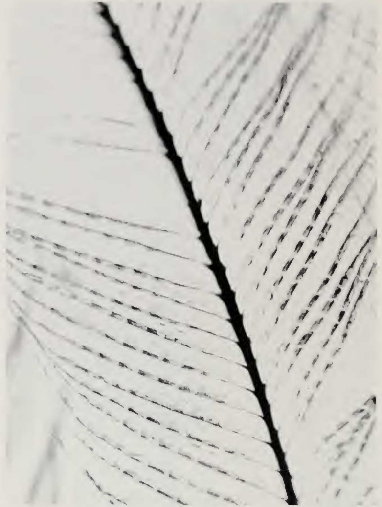
FIG. 4. Photomicrograph (250 \times ) of fossil feather showing pennaceous barbules at base feather.

Turquoise-browed Motmot ( Eumomota superciliosa ), Giant Hummingbird ( Patagona gigas ), Long-tailed Hermit ( Phaethornis superciliosus ), and White-mantled Barbet ( Capito hypoleucus ). The nodal structures on the plumulaceous barbules of only the trogon and the barbet were similar to those of the fossil feather. In the trogon, the distance between the nodes along the entire pennulum was greater; the pigmented nodal area and the